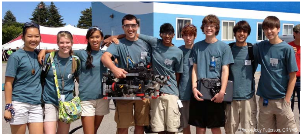
Gray's Reef competition winners from Carrollton High School at MATE 2014 Internationals held at Thunder Bay NMS.

MATE ROV building workshops and competitions provide a vehicle to apply STEM education concepts, preparing students for secondary education and careers, and offering educators training and expertise in applied technologies.