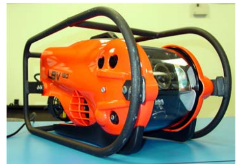
Commercial ROV.