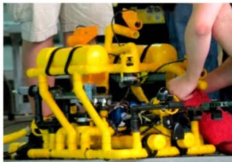
Competition ROV.